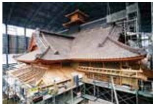
Completed tile roofing (2009)