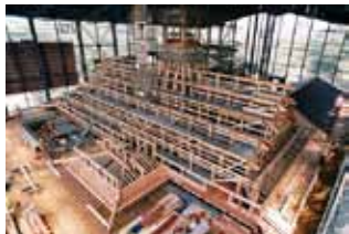
Half-built magistrate's office building (2008)

The reconstruction of Hakodate Magistrate's Office took four years from 2006 to 2010. In approximately 1,000 square meters site, "Miyadaiku" carpenters gathered from all over the country. Their arts of building Japanese traditional architectures reproduced these historic buildings in the way it used to be.