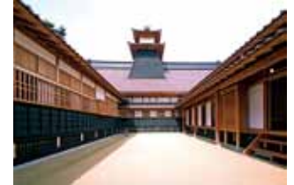
Drum tower looked up from the courtyard