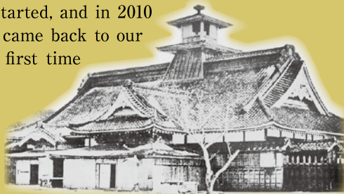
Old photograph of Hakodate Magistrate's Office

The repair project of Goryokaku was launched by the city of Hakodate with the recreation of Hakodate Magistrate's Office as its main goal. The archaeological investigation of Goryokaku was started in 1985. The building plan was carefully detailed on the basis of old photographs, documents and drawings as well as the results of the excavation. In 2006 the reconstruction was finally started, and in 2010 the building came back to our time for the first time in 140 years.